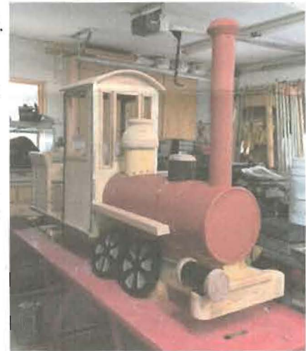
Static Display Loco under construction at Bell's Toyland Shop

The Contractors Association of Truckee Tahoe (CATT) community project committee has agreed to construct our scaled and historically accurate replica of a Sierra snowshed. It will be 27 feet long, with doors, and will be used for history interpretation, safety education and storage of our riding cars and other equipment when not in use. Construction should start as soon as the weather permits. The train will also run